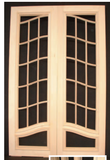
Woodbending by Woodform